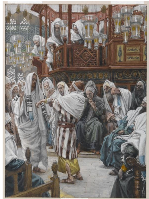
James Tissot The Man with the Withered Hand