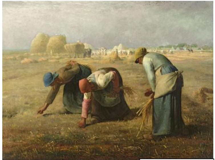
Jean Francois Millet The Gleaners

God of every harvest, we offer our lives and the fruit of our labors to you that we may proclaim the life of Jesus Christ, the true gift to all. Amen.