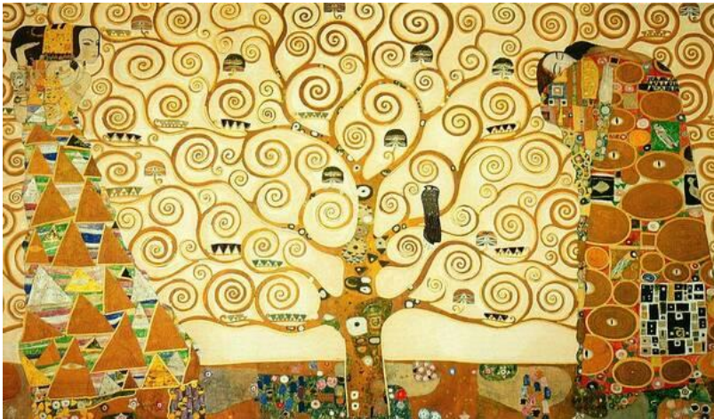
Gustav Klimt The Tree of Life