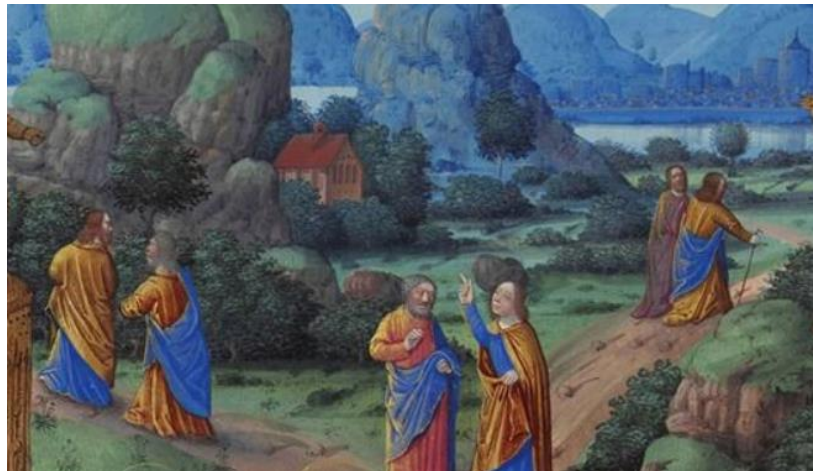
Limbourg brothers The Apostles Going Forth to Preach

Lord God, through Jesus Christ you have called us to follow you and not look back. Lead us forth in faith, proclaiming the good news of your coming realm of righteousness, justice, and peace. Make us fit to follow you, setting our faces toward the new Jerusalem; through Jesus Christ our Savior. Amen.