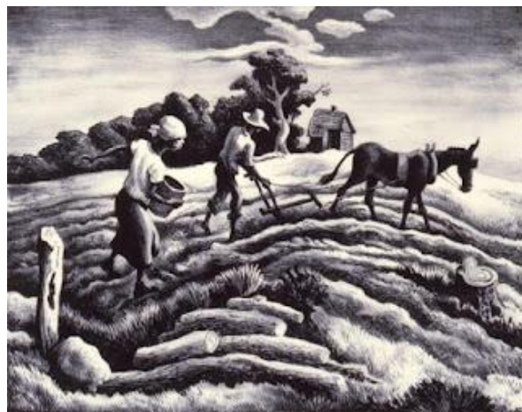
Thomas Hart Benton Planting (Spring Plowing)

When the days drew near for [Jesus] to be taken up, he set his face to go to Jerusalem. 52 And he sent messengers ahead of him. On their way they entered a village of the Samaritans to make ready for him; 53 but they did not receive him, because his face was set toward Jerusalem. 54 When his disciples James and John saw it, they said, "Lord do you want us to command fire to come down from heaven and consume them?" 55 But he turned and rebuked them. 56 Then they went on to another village. 57 As they were going along the road, someone said to him, "I will follow you wherever you go." 58 And Jesus said to him, "Foxes have holes, and birds of the air have nests; but the Son of Man has nowhere to lay his head." 59 To another he said, "Follow me." But he said, "Lord, first let me go and bury my father." 60 But Jesus said to him, "Let the dead bury their own dead; but as for you, go and proclaim the kingdom of God." 61 Another said, "I will follow you, Lord; but let me first say farewell to those at my home." 62 Jesus said to him, "No one who puts a hand to the plow and looks back is fit for the kingdom of God."