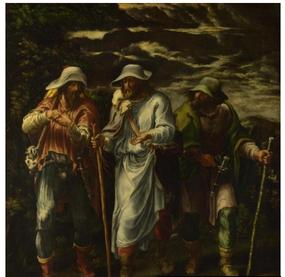
Lelio Orsi Walk to Emmaus