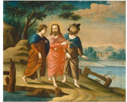
American 18 th Century Christ on the Road to Emmaus

God of all power and glory, receive these prayers, and continue your mighty work among us, through Jesus Christ, our living Lord. Amen.