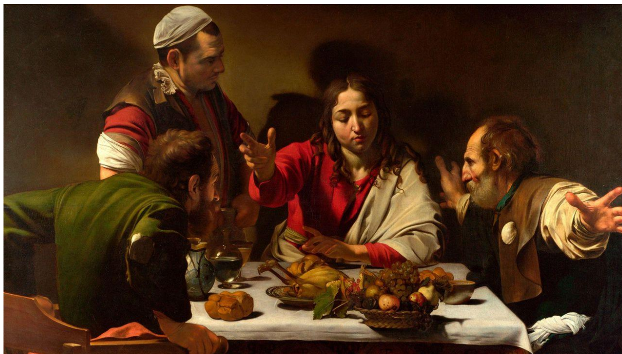
Caravaggio Supper At Emmaus