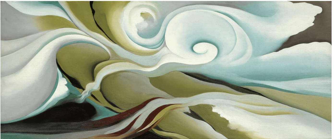
Georgia O'Keefe A Force of Nature

First Presbyterian Church, McAllen June 4, 2023 – Trinity Sunday A Communion Worship Service