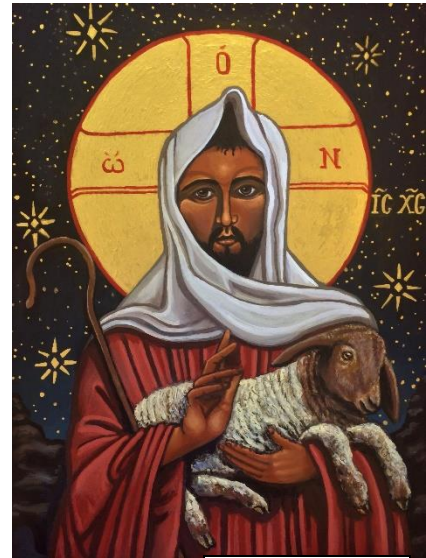
Kelly Latimore Good Shepherd

Good shepherd, guide and guardian, you call us to live the love you have shown us, not with words or speech, but with action and truth; you call us to show your love in our deeds. As sheep of your pasture, may we be a flock known for our love and our gratitude. Called to be your church, may we be shepherds of your mercy and agents of your grace. Amen.