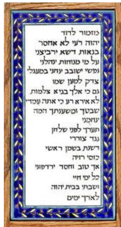
Psalm 23 in Hebrew

I'm back home in the house of God for the rest of my life.