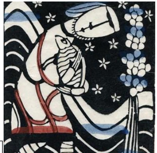
Sadao Watanabe Good Shepherd

Lord God, good shepherd, by the leading of your Spirit, help us to listen for your voice and follow in your paths all the days of our lives; in Jesus' name. Amen.