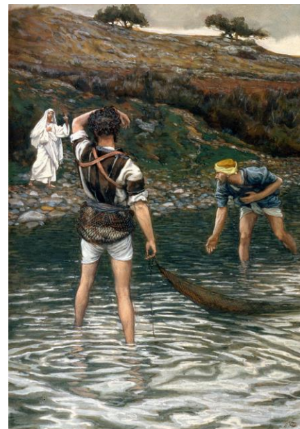
James Tissot The Calling of Saint Peter and Saint Andrew

God of all people, you sent your Son into the shrouded world into the borderlands; may his dawning light give hope to the broken, the persecuted, the alien and the excluded, that we might feel the kingdom drawing near and turn to follow him; through Jesus Christ, the morning star. Amen.