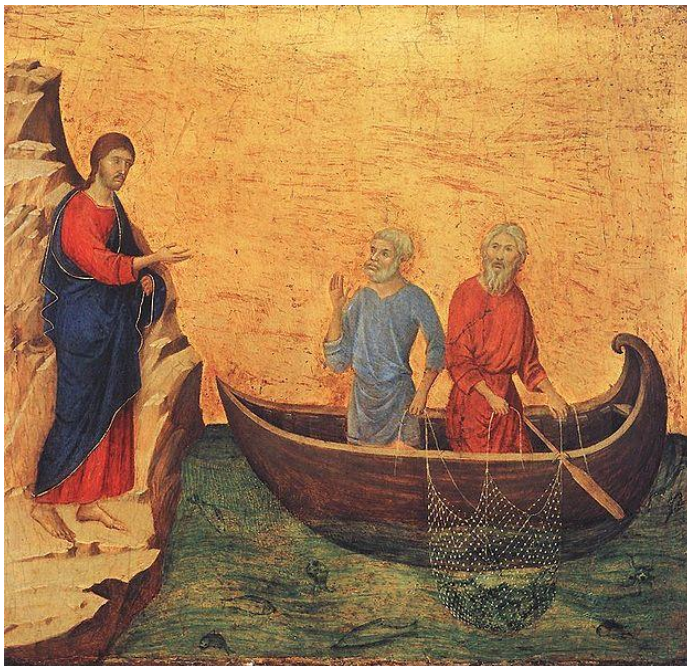
Duccio di Buoninsegna Calling of Peter and Andrew

13 He left Nazareth and made his home in Capernaum by the sea, in the territory of Zebulun and Naphtali, 14 so that what had been spoken through the prophet Isaiah might be fulfilled: 15 “Land of Zebulun, land of Naphtali, on the road by the sea, across the Jordan, Galilee of the Gentiles -- 16 the people who sat in darkness have seen a great light, and for those who sat in the region and shadow of death light has dawned.” 17 From that time, Jesus began to proclaim, “Repent, for the kingdom of heaven has come near.” 18 As he walked by the Sea of Galilee, he saw two brothers, Simon, who is called Peter, and Andrew his brother, casting a net into the sea -- for they were fishermen. 19 And he said to them, “Follow me, and I will make you fish for people.” 20 Immediately they left