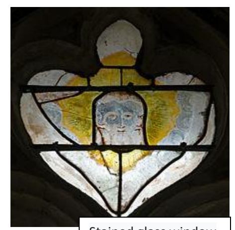
Stained glass window Saint Martin church, Courgenard, France.