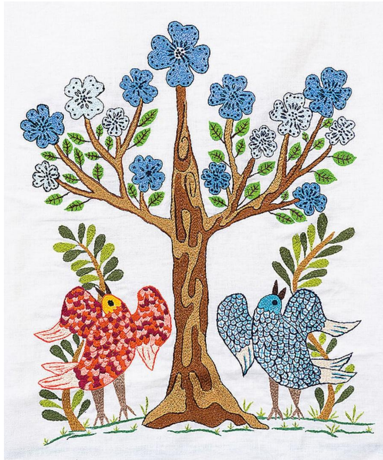
Susie Phillips Two Singing Birds