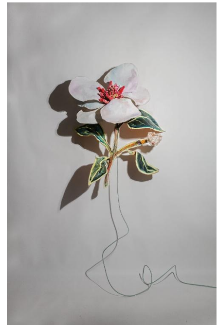
Elizabeth Chapin Magnolia Sconce

With heart and soul and might we will love and serve you alone, glorifying your holy name. All thanks and praise to you, O triune God, now and forever. Amen.