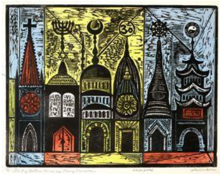
Living Amen In My Father's House There are Many Mansions