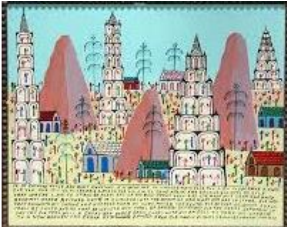
Howard Finster In My Father's House are Many Mansions