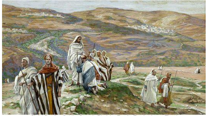
Christ Sending Out the Seventy Disciples Two by Two by James Tissot

Loving God, with these gifts, bring healing and hope where illness and despair prevail. Bring peace into the warring madness of our world, and shine the light of your love into every dark corner. Loving God, transform these gifts and transform each of us that we may be your loving presence and your healing hope in the world. Amen.