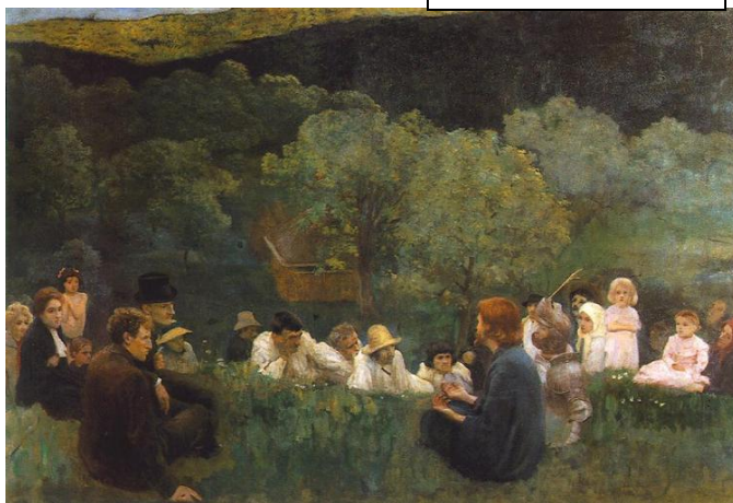
Károly Ferenczy Sermon on the Mount

When we are foolish, be our wisdom; when we are weak, be our strength; that, as we learn to do justice and to love mercy, your rule may come as blessing. Amen.