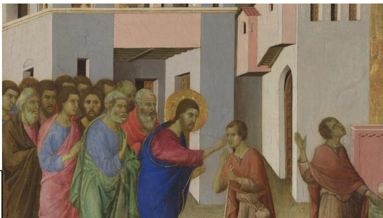
Duccio di Buoninsegna Healing of the Man Born Blind

In life and in death we belong to God. Through the grace of our Lord Jesus Christ, the love of God, and the communion of the Holy Spirit, we trust in the one triune God, the Holy One of Israel, whom alone we worship and serve.