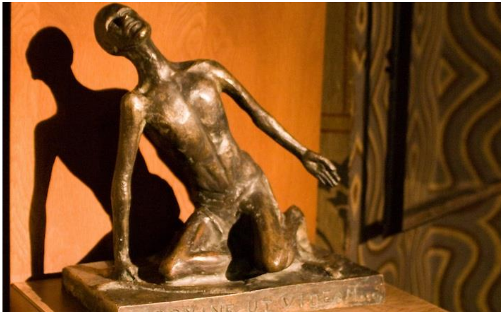
Lord, That I Might See Budapest, Hungary

First Presbyterian Church, McAllen Sunday Worship – March 19, 2023 Fourth Sunday in Lent