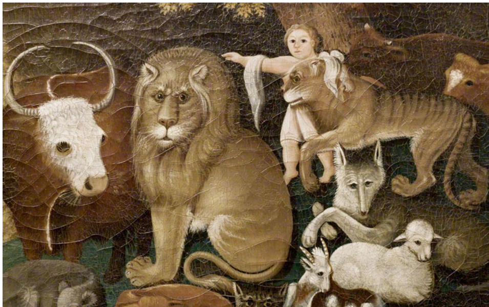
Edward Hicks Peaceable Kingdom, detail

Church Administrator: fpchurch@sbcglobal.net